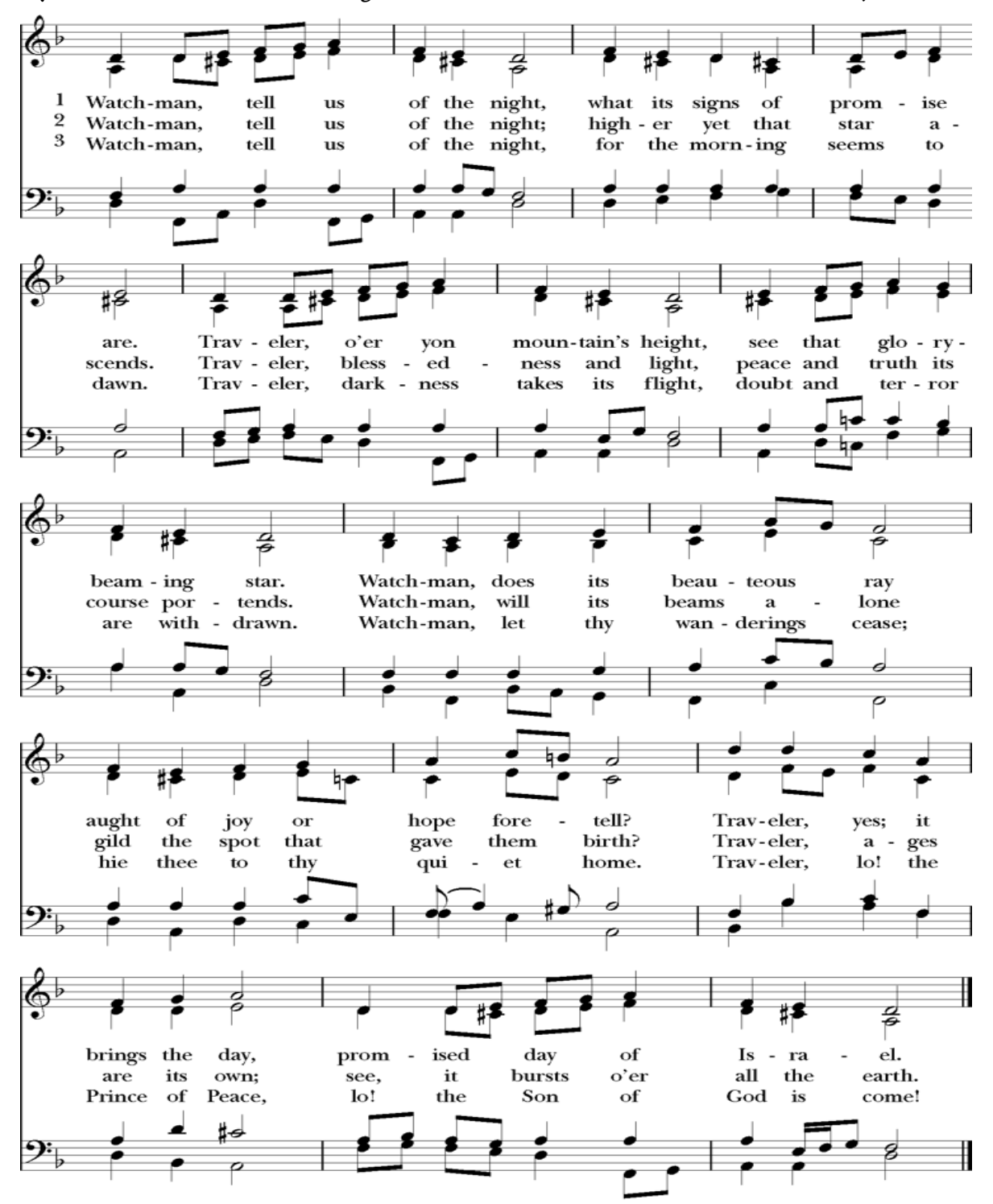
Two groups may sing antiphonally, alternating by sentences.