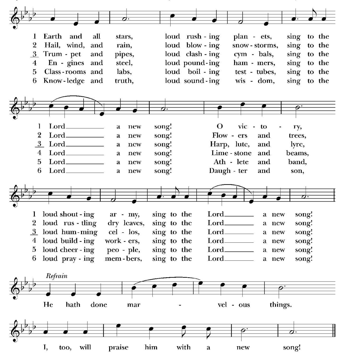
Hymn: Earth and all stars (see words in insert, sung to the tune "Earth and All Stars, Blue Hymnal 412)